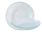
Organic Glass Bowl GLCLOB241 24.5cm 9 5/8" 110cl 37oz CTN QTY 6