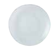
Organic Glass Plate GLCLOP291 29.5cm 11 3/4" CTN QTY 6