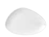
Chefs' Triangle Plate WHISIC301 30.4 x 20.5cm 12 x 8" CTN QTY 6