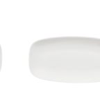
Chefs' Oblong Plate WHISO111 29.5 x 15cm 11 3/4" x 6" CTN QTY 12