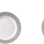
Plate SHISIP8 1 21cm 8 1/4" CTN QTY 12

Footed Plate SHISIF9 1 23.4cm 9 1/8" CTN QTY 12