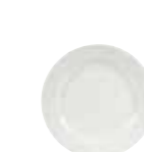
Footed Plate WHISIF91 23.4cm 9 1/4" CTN QTY 12