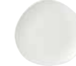
Organic Round Plate WHISO111 28.6cm 11 1/4" CTN QTY 12