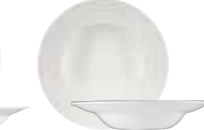
Wide Rim Bowl WHISIBL1 28cm 11" 46.8cl 16.5oz CTN QTY 12