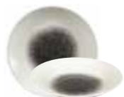
Quartz Black Deep Coupe Plate RKBQID271 28.1cm 11" H: 3.7cm CTN QTY 12