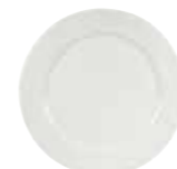
Presentation Plate WHISIP121 30.5cm 12" CTN QTY 12