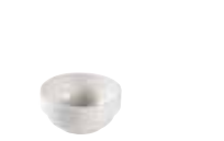
Consomme Bowl WHISIB141 36cl 12.6oz CTN QTY 6 (Fits WH FS6 1)