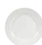
Footed Plate WHISIF581 27.6cm 10 7/8" CTN QTY 12