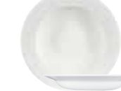
Pasta Bowl WHISIPB1 30.8cm 12 1/8" 87.5cl 30.5oz CTN QTY 12