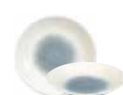
Topaz Blue Deep Coupe Plate RKTBD251 25.5cm 10" H: 3.5cm CTN QTY 12