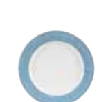
Plate OCISIP8 1 21cm 8 1/4" CTN QTY 12

GF Footed Plate OCISIF9 1 23.4cm 9 1/2" CTN QTY 12