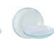
Organic Glass Bowl GLCLTB11 17cm 6 1/2" 26.5cl 9.3oz CTN QTY 6