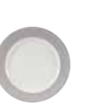
Plate SHISIP651 17cm 6 5/8" CTN QTY 12