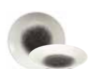
Quartz Black Deep Coupe Plate RKBQID251 25.5cm 10" H: 3.5cm CTN QTY 12

★ Covered by Churchill 5 Year Edge Chip Warranty