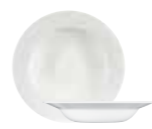
Rimmed Bowl WHISIRS1 24.9cm 9 3/4" 50cl 17.5oz CTN QTY 12