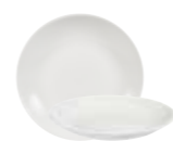
Deep Coupe Plate WHISID251 25.5cm 10" H: 3.5cm CTN QTY 12