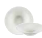
Oatmeal Bowl WHISIOB1 17cm 6 3/4" 25.6cl 9oz CTN QTY 12