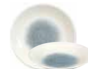
Topaz Blue Deep Coupe Plate RKTBD271 28.1cm 11" H: 3.7cm CTN QTY 12