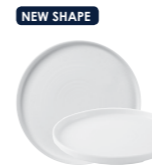
Chefs' Walled Plate WHISIP261 26cm 10 3/4" H: 2cm CTN QTY 6