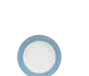
Plate OCISIP651 17cm 6 5/8" CTN QTY 12