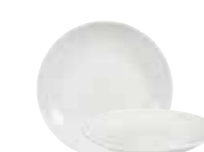
Deep Coupe Plate WHISID271 28.1cm 11" H: 3.7cm CTN QTY 12