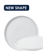
Chefs' Walled Plate WHISIP211 21cm 8 1/4" H: 2cm CTN QTY 6