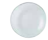
Organic Glass Plate GLCLTP11 22.5cm 8 7/8" CTN QTY 6