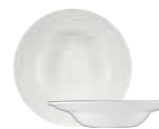
Wide Rim Bowl WHISIBM1 24cm 9 1/2" 28.4cl 10oz CTN QTY 12