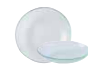
Organic Glass Bowl GLCLTB21 21cm 8 1/4" 60cl 21oz CTN QTY 6