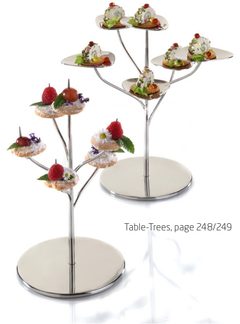
Table-Trees, page 248/249