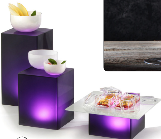
"Neo", page 32