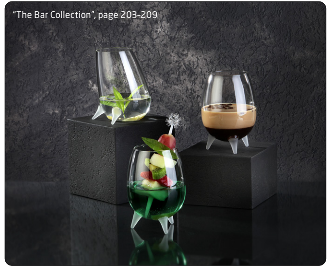
"The Bar Collection", page 203-209