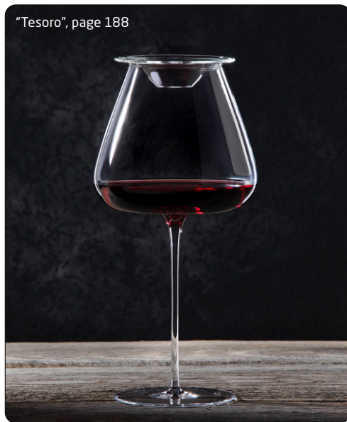
"Tesoro", page 188