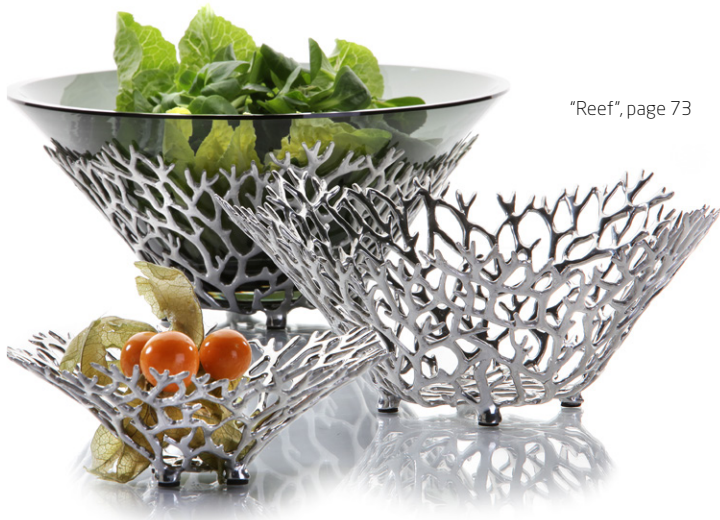
"Reef", page 73