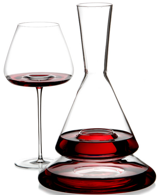
"Doppio", page 192