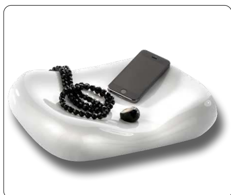
The china pillow "Donna" is available on page 155.