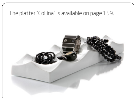
The platter "Collina" is available on page 159.